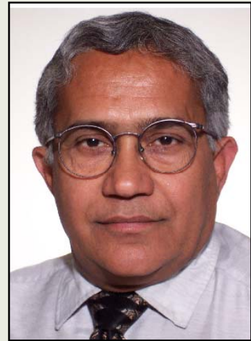
Resident of Etobicoke Since 1975